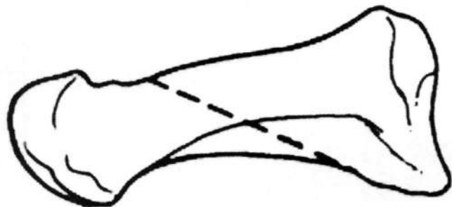
Fig. 2. Medial view of the Mau osteotomy.